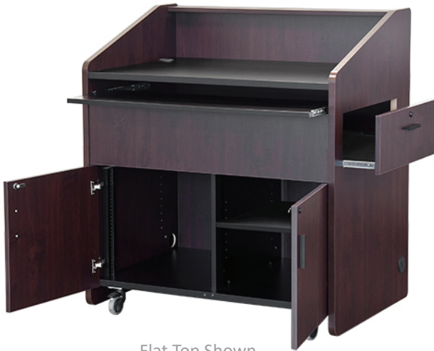
Flat Top Shown

Top rear removable, intended to easily be mounted in a wedge position or as flat large work surface, that can support monitors laptops and room control systems.